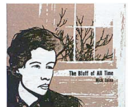
The Bluff of All Time (2005)